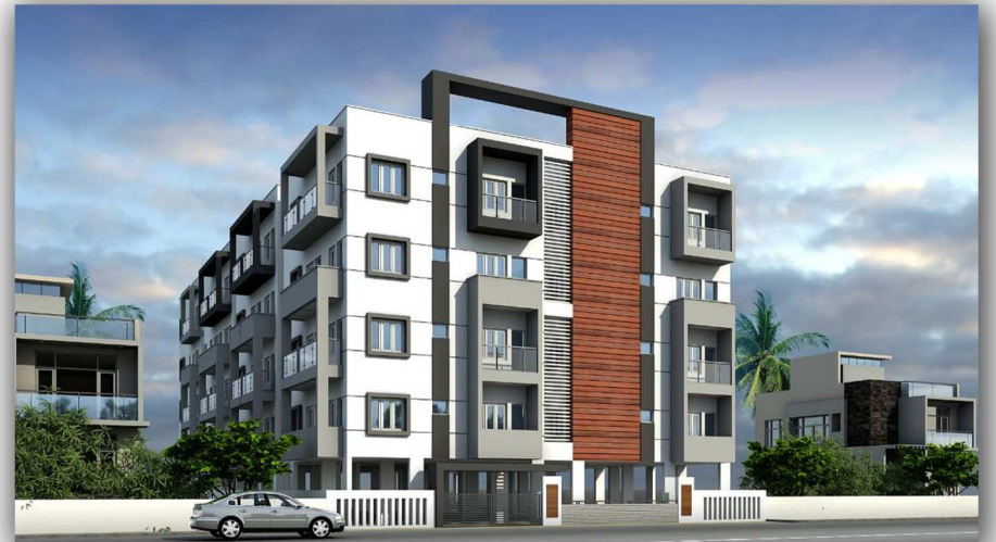
Teja Residency ~ III