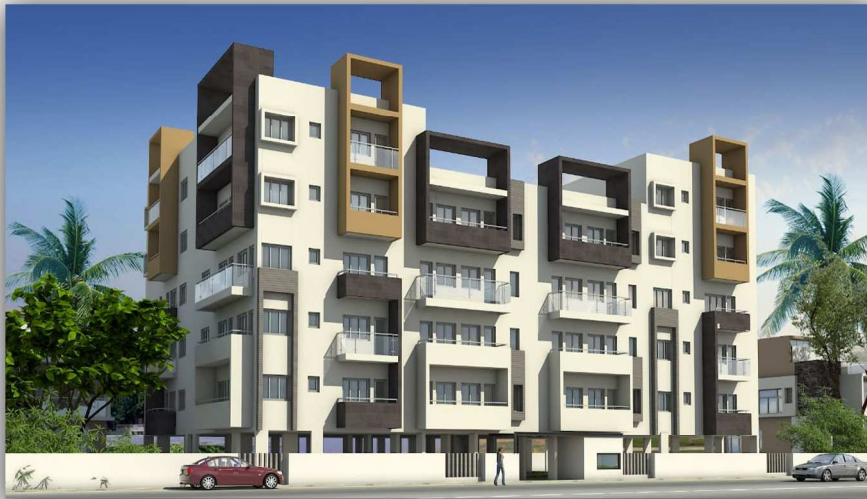
Teja Residency ~ I