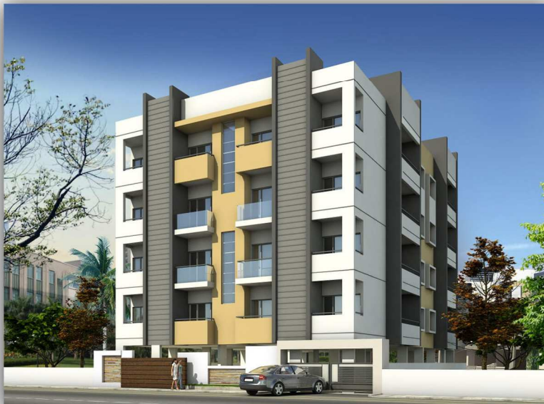
Teja Residency ~ II