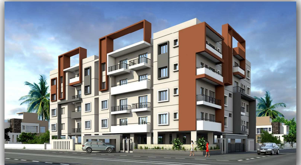
Sai Teja Garden